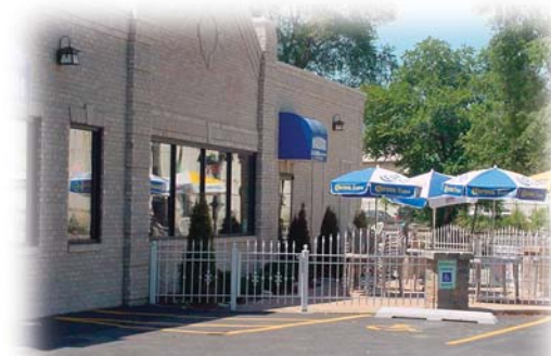
The incorrect way.

Handicap-accessible parking zones must be properly identified.