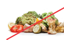
NO Food Waste (Compost instead!)