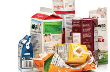
Food & Beverage Cartons