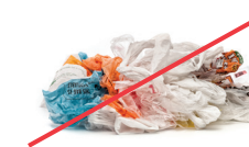
NO Plastic Bags & Film (Find a recycling site at plasticfilm-recycling.org )