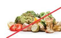
NO Food Waste (Compost instead!)