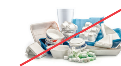
NO Foam Cups & Containers (Check Earth911.org for options.)

To Learn More Visit: RecycleOftenRecycleRight.com #RORR